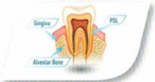
Key components surrounding teeth