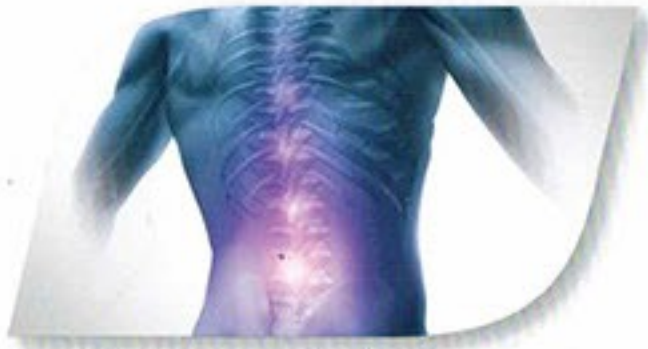
Bone stimulation increases rate of healing process

AcceleDent Aura builds on the clinical benefits of vibration and applies SoftPulse Technology to help safely speed the rate of tooth movement.