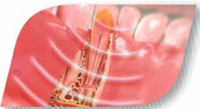
SoftPulse Technology® can help your teeth move up to 50% faster

AcceleDent Aura's SoftPulse Technology releases a safe and effective light force pulse that transmits through the roots of your teeth to the surrounding bone socket. This helps accelerate the cellular response and speeds the rate with which your teeth can move. When used in conjunction with orthodontics, AcceleDent Aura has been clinically proven to move teeth up to 50% faster.