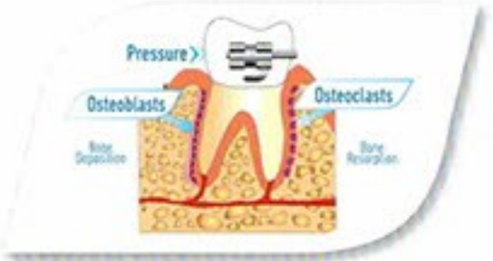
Tooth movement illustrated

Bone remodeling is how teeth move through bone. Force applied to the teeth cause bone cells (osteoblasts and osteoclasts) to mobilize around the root of the tooth in the periodontal ligament (PDL). This cellular response causes changes in the bone surrounding the tooth that allow it to move through the bone.